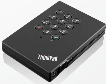
ThinkPad® USB Secure Hard Drive