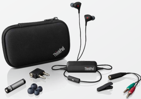
The ThinkPad® Noise Cancelling Earbuds