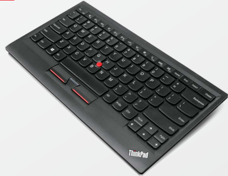
ThinkPad® Wireless Bluetooth® Keyboard with TrackPoint®