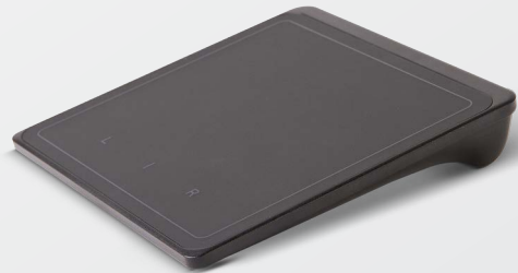
Lenovo® Wireless TouchPad for Windows 8